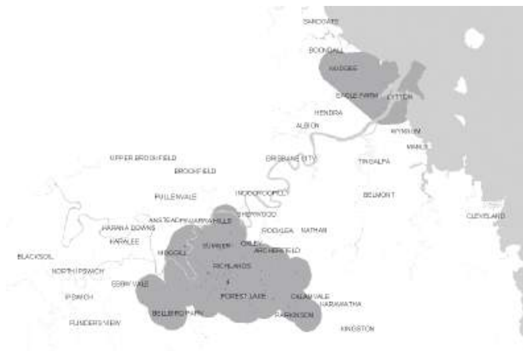
FIGURE 1. Area of Brisbane (shaded) putatively infested by Solenopsis invicta .