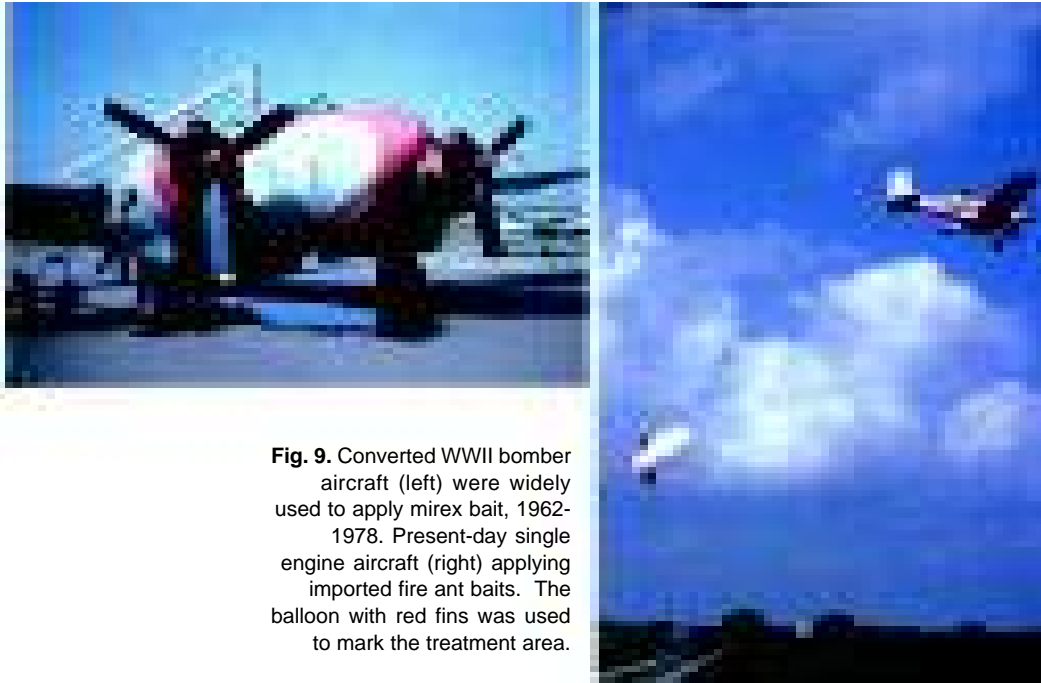
Fig. 9. Converted WWII bomber aircraft (left) were widely used to apply mirex bait, 1962-1978. Present-day single engine aircraft (right) applying imported fire ant baits. The balloon with red fins was used to mark the treatment area.