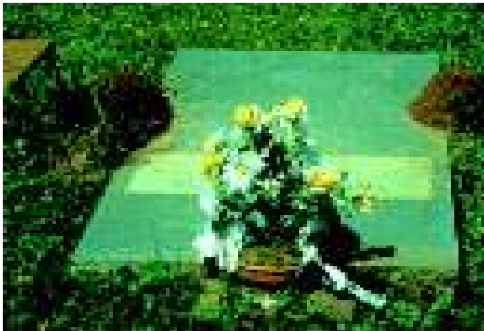
Fig. 4. Solenopsis invicta mounds next to gravestone (Saucier, MS). This is not an uncommon sight in cemeteries in infested areas.

tried. However, it is still with us and its range expansion continues to pose major problems. During the 60+ years since the first report of this ant, millions of dollars have been spent by federal and state governments in attempts to control or eradicate it. It is without a doubt, one of the most studied ants in the world as well as the most expensive, considering the total amount of money that has been spent on control programs and research on its biology and ecology. In 1997, the Texas legislature appropriated 2.5 million dollars for fire ant research, control, and extension (Drees 1998); and the state of California has proposed funding of 8.7 million dollars in fiscal year 1999/2000 and 7.3 million dollars annually for the subsequent 4 years to eradicate/control this pest (California De-