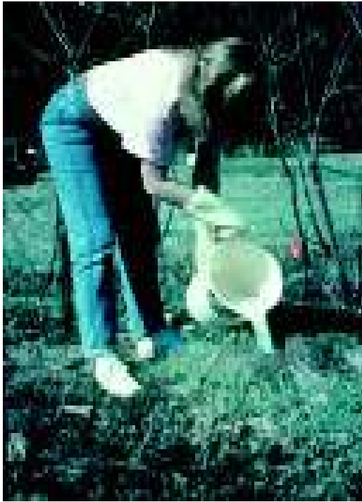
Fig. 13. Drenching an individual Solenopsis invicta mound with a contact insecticide in Gulfport, MS. Note, because of the radiating foraging tunnels, standing close to a mound could result in stings.