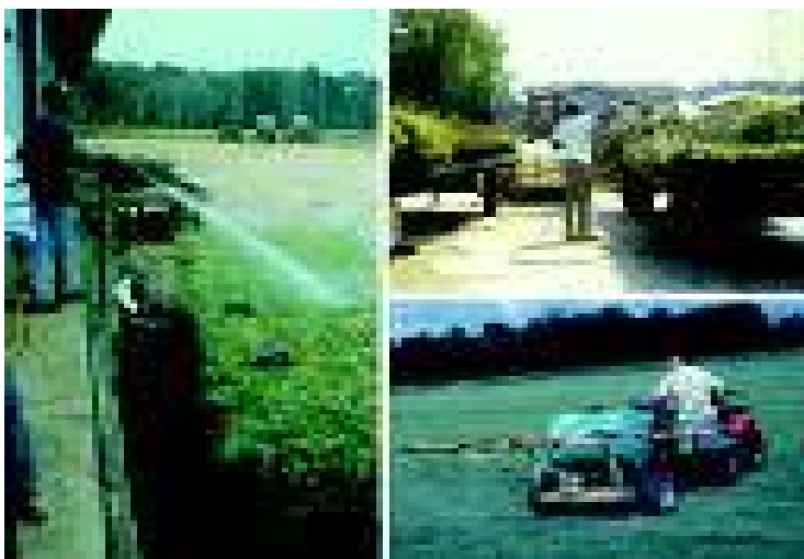
Fig. 8. Applying insecticides to nursery stock before shipment required by federal quarantine in Folsom, LA (left and upper right), and Long Beach, MS (lower right).

tion. However, the requirements for an effective toxicant in fire ant bait are strict, and researchers faced several challenges in the development of baits. For example, the toxicant in the bait must (1) exhibit delayed toxicity so that it can be distributed to most members of the colony before the ants die, (2) be effective over a wide dosage range (preferably a 10- to 100-fold range) so that dilution of the toxicant is not a factor when transferred among members of the colony via trophallaxis, (3) not be repellent, and (4) be easy to formulate with foods and carriers (Stringer et al. 1964, Williams 1983, Banks et al. 1985). Few chemicals have been successful as bait toxicants for this species because of these restrictions. Those that met the requirements were formulated as follows: a toxicant (the active ingredient usually less than 1.0%), an attractant such as soybean oil, and an inert carrier. Travis (1939) conducted field studies with baits containing thallium sulfate or thallium acetate in syrup against the fire ant Solenopsis geminata (F.). Thallium acetate showed some promise in field studies. Green (1952) reported that a bait consisting of