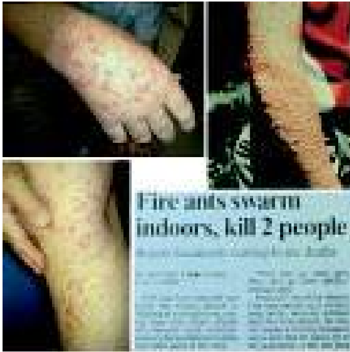
Fig. 3. Photographs of multiple Solenopsis invicta stings. The USA Today newspaper article (21 September 1999) reported on nursing-home deaths caused by fire ants.

tried. However, it is still with us and its range expansion continues to pose major problems. During the 60+ years since the first report of this ant, millions of dollars have been spent by federal and state governments in attempts to control or eradicate it. It is without a doubt, one of the most studied ants in the world as well as the most expensive, considering the total amount of money that has been spent on control programs and research on its biology and ecology. In 1997, the Texas legislature appropriated 2.5 million dollars for fire ant research, control, and extension (Drees 1998); and the state of California has proposed funding of 8.7 million dollars in fiscal year 1999/2000 and 7.3 million dollars annually for the subsequent 4 years to eradicate/control this pest (California De-