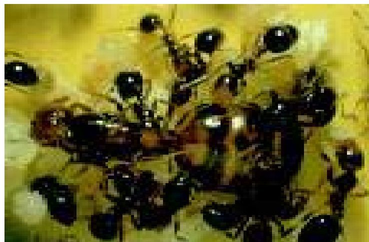
Fig. 2. Small colony of Solenopsis invicta with queen surrounded by workers and immature stages. These colonies can be transported easily with soil and nursery stock.

The control of S. invicta has taken many twists and turns during the years since its first discovery with a great deal of advice given, numerous solutions recommended, and many control techniques