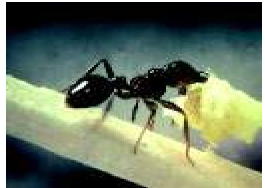
Fig. 10. Solenopsis invicta worker carrying a bait particle of defatted corn grit with soybean oil and toxicant.

During the 1980s, chemicals other than hydramethylnon were showing promise as potential toxicants in imported fire ant baits. Some of these eventually would become registered for use whereas others would go through the long process of development and testing only to be discontinued for one reason or another. For example, Williams and Lofgren (1981) reported that a new chemical from Eli Lilly, EL-468 (a phenylenediamine), was effective in both laboratory and field studies against S. invicta . The chemical also was formulated in a soybean oil-pregelged defatted corn grit bait and given the trade name, Bant. But at the