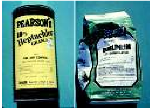
Fig. 7. Heptachlor and dieldrin insecticides were used by federal and state governments and by individuals in the 1950s in an effort to combat Solenopsis invicta . An eradication program initiated in 1957 dictated the use of aerial and ground applications of granular heptachlor and dieldrin.

tion. However, the requirements for an effective toxicant in fire ant bait are strict, and researchers faced several challenges in the development of baits. For example, the toxicant in the bait must (1) exhibit delayed toxicity so that it can be distributed to most members of the colony before the ants die, (2) be effective over a wide dosage range (preferably a 10- to 100-fold range) so that dilution of the toxicant is not a factor when transferred among members of the colony via trophallaxis, (3) not be repellent, and (4) be easy to formulate with foods and carriers (Stringer et al. 1964, Williams 1983, Banks et al. 1985). Few chemicals have been successful as bait toxicants for this species because of these restrictions. Those that met the requirements were formulated as follows: a toxicant (the active ingredient usually less than 1.0%), an attractant such as soybean oil, and an inert carrier. Travis (1939) conducted field studies with baits containing thallium sulfate or thallium acetate in syrup against the fire ant Solenopsis geminata (F.). Thallium acetate showed some promise in field studies. Green (1952) reported that a bait consisting of