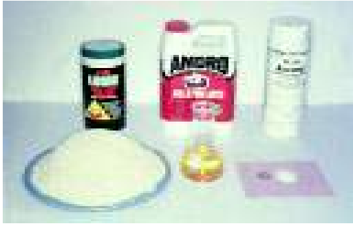
Fig. 11. Amdro, Logic, and Affirm (Ascend), imported fire ant baits that were developed as replacements for mirex bait. The baits consist of the active ingredients (small white powder, right foreground) dissolved in soybean oil (beaker in middle) and applied to defatted corn grits (material on plate on left foreground).

point of registration, toxicological studies revealed possible teratogenic effects, and it was withdrawn and all research and development were stopped (Lofgren 1986c). Another product, Prodrone, which was an insect growth regulator (IGR), was granted conditional registration by the EPA in 1983, but, because of its inconsistent results and the long time interval for obtaining control, it never gained widespread use (Banks 1986) and soon was phased out. Another IGR, Maag RO 13-5223, gave excellent results in laboratory and field tests (Banks et al. 1983, 1988; Banks 1986; Phillips and Thorvilson 1989). This chemical, called fenoxycarb, is an ethyl carbamate that produces IGR effects in S. invicta and other insects (Glancey et al. 1990). Glancey et al. (1989) demonstrated the deleterious effects of fenoxycarb on the queen reproductive system of this ant. The product is formulated in baits called Logic and Award by Novartis Crop Protection of Greensboro, NC. It was registered by the EPA for use against imported fire ants in late 1985. For a review of the development of IGRs as baits against this ant, also see Banks (1986) and Banks et al. (1978).