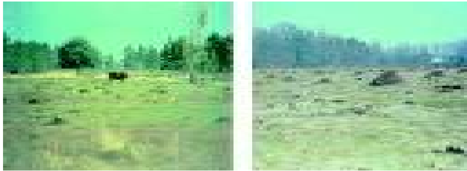
Fig. 5. Pastures infested with numerous Solenopsis invicta mounds in Lakeland, FL (left), and Opelousas, LA (right). Imported fire ants can be a threat to livestock and cause economic losses in the cattle industry.

lar heptachlor by aircraft at a rate of 2 lb/acre (2.24 kg/ha) with excellent results (USDA-ARS 1958).