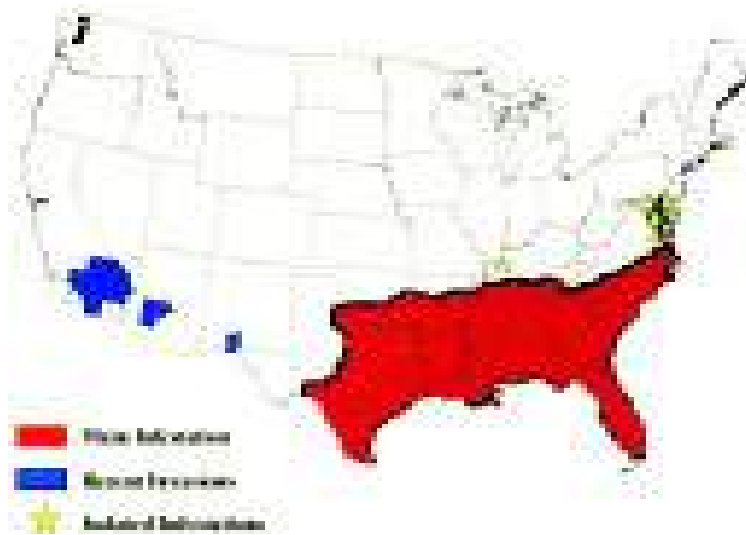
Fig. 1. Distribution map of Solenopsis invicta in the United States showing the main infestation (red), recent invasions (blue), and isolated infestations (yellow star) that are reported to have been eradicated.

of them. The current S. invicta / S. richteri quarantine map is maintained by the United States Department of Agriculture (USDA)-Animal Plant Health Inspection Service (APHIS)-Plant Protection and Quarantine (PPQ) ( http://www.aphis.usda.gov/oa/antmap ).