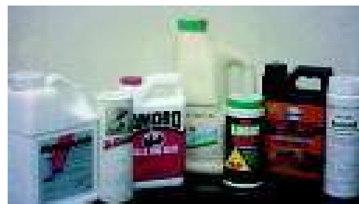
Fig. 12. An array of bait products registered for use against imported fire ants. Not all registered products are shown.

The first method of control of imported fire ants was treating individual mounds with contact insecticides (Fig. 13). This was followed by the use of broadcast applications of these contact chemicals. With the development of toxic baits, the broadcast application of these baits was and is today the most effective method of controlling fire ants, especially over large areas. It also is the most efficient method of maintaining control for longer periods (Lofgren and Weidhaas 1972; Williams 1983, 1994; Banks 1990). Broadcasting baits to large areas also is better for slowing migration of colonies into treated areas from untreated ones. Although newly mated queens from mating flights will reinfest a recently treated area, several months are required before these new queens will produce colonies of sufficient size to be noticeable (Callcott and Collins 1992, Collins et al. 1992). Concurrently, with the development of post-mirex baits, a variety of contact insecticides has been formulated for S. invicta control (Sheppard 1988, Drees and Vinson 1993, Drees and Summerlin 1998, Collins and Callcott 1995). These contact insecticides usually kill ants quickly, but, in many cases, they do not kill the queen, and the colony survives and reestablishes. However, if applied appropriately, a majority of the ants in a colony can be killed quickly. This reduces the potential danger from stings much