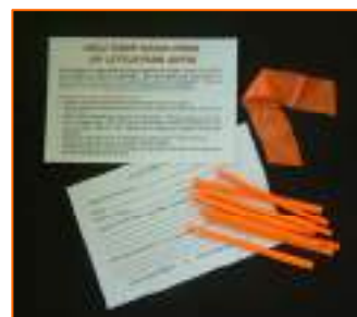
Table 1: Outreach Efforts and Events

For a Science Fair held in Kilauea, March of 2005, an "Inspection Kit" was put together to use as a tool for surveying private properties. These kits were demonstrated first-hand at the fair and "surveys" were performed at the site. This tool served as a "talking point" for fair-goers and approximately 50 kits were handed out to the public. No reports of LFA followed this event. Stickers were also available for interested youngsters.