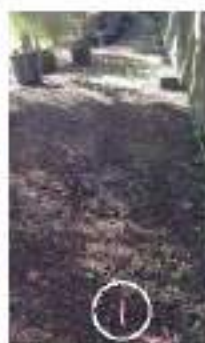
Near a shadehouse

3. Pick up the chopstick very carefully to avoid dislodging ants, and examine the ants on the peanut butter.