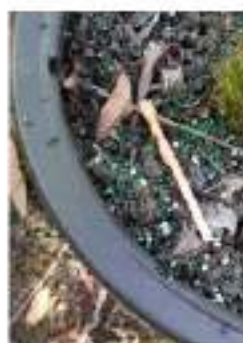
In a pot

2. Place the chopstick with peanut butter in an area where you see ants, preferably in the shade, at the base of a tree, etc.; leave it out for about 1 hour.