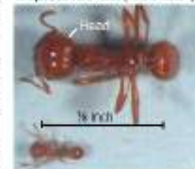
Little fire ant