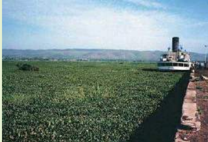
Water hyacinth on Lake Victoria

This South American native is one of the worst aquatic weeds in the world. Its beautiful, large purple and violet flowers make it a popular ornamental plant for ponds. It is now found in more than 50 countries on five continents. Water hyacinth is a very fast growing plant, with populations known to double in as little as 12 days. Infestations of this weed block waterways, limiting boat traffic, swimming and fishing. Water hyacinth also prevents sunlight and oxygen from reaching the water column and submerged plants. Its shading and crowding of native aquatic plants dramatically reduces biological diversity in aquatic ecosystems.