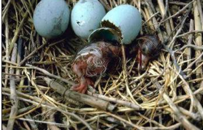
Tricolor heron chick being attacked by fire ant workers.

Severe impacts on native vertebrate species have also been observed in the USA. Affected species include small rodents (Holtcamp et al. 1997) deer (Allen et al. 1997a), ground nesting birds (Allen et al. 1995; Giuliano et al. 1996; Pedersen et al. 1996), alligators (Allen et al. 1997b), and even sea turtles (Allen et al. 2001). Island ecosystems are likely to be far more vulnerable to biological invasions than mainland USA so it is likely that similar or greater impacts will be seen on Pacific Islands (e.g. crazy ants on Christmas Island).