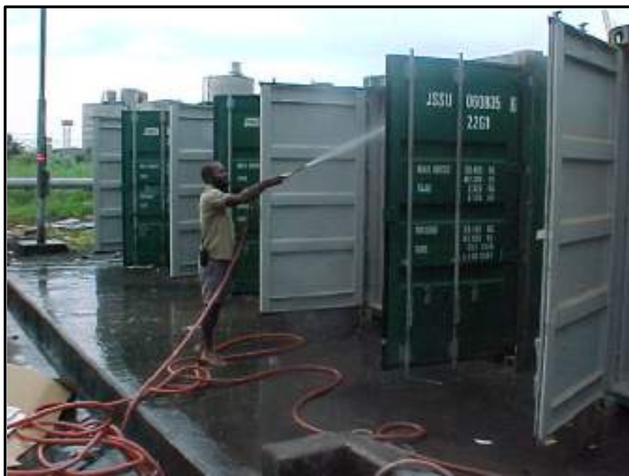
Container washdown in Papua New Guinea.