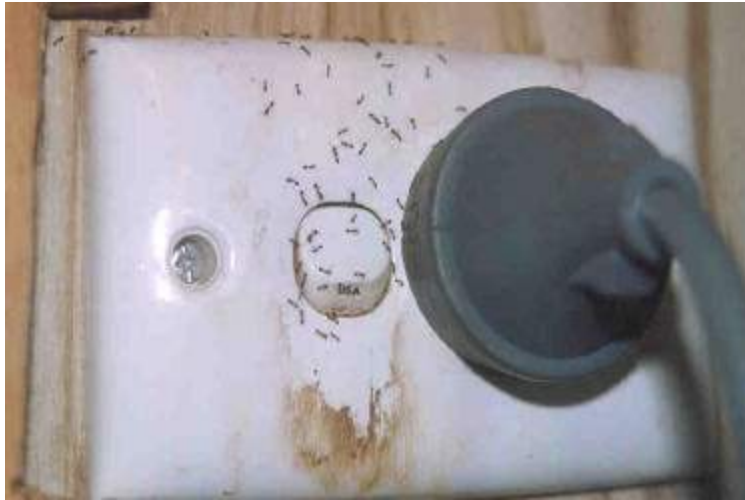
Singapore ant ( Monomorium destructor ) infested walls on Bathurst Island causing fire hazards.

It also is commonly associated with food preparation areas. M. destructor frequently stings people and the residents of the Tiwi Islands complain about having to co-exist with this species (pers. comm Hoffman 2003).