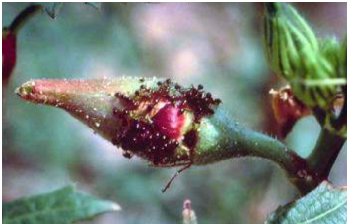
Fire ant feeding on okra bud.

A recent comprehensive economic analysis of impact costs in Texas, USA (population approximately 20 million) concluded that the total annual economic costs to that state alone exceeded US$1.2 billion (Lard et al. 2002). Approximately 60 percent of this cost was borne directly by residential households for control and repair costs. Almost US$150 million is spent annually on repair and replacement of electrical and communications equipment, and US$90 million on agricultural losses.