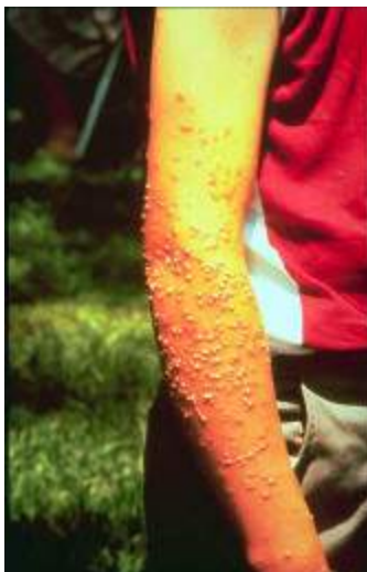
Pustules, blisters formed following fire ant sting on arm.

A survey of 1286 practitioners in South Carolina (USA) (population, four million), where fire ants are well established, estimated that annually over 33,000 people (94 per 10 000 population) seek medical consultation for RIFA stings, and, of these, 660 people (1.9 per 10,000 population) are treated for anaphylaxis (Caldwell et al. 1999). Direct extrapolation of these data to the Australian situation for example would suggest that about 140,000 consultations and 3,000 anaphylactic reactions are to be expected annually should Red Imported Fire Ants become established in that country.