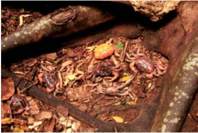
Red land crabs ( Gecarcoidea natalis ) killed as result of Yellow Crazy ants ( Anoplolepis gracilipes ) infestation on Christmas Island.

dieback. On Christmas Island in the Indian Ocean, secondary invasions of giant African landsnails ( Achatina fulica ) and shade-intolerant woody plants can follow invasion by A. gracilipes , further degrading native forests.