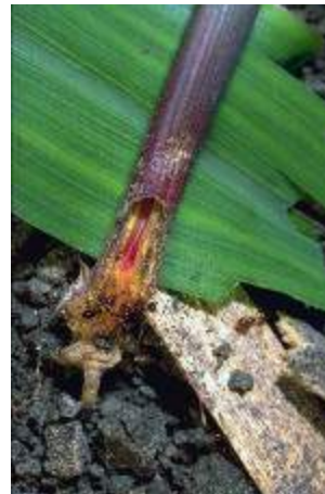
Fire ant damage to base of corn plant.

A recent study on the potential economic impacts of RIFA in Australia estimated conservatively that the cost of uncontrolled spread of Red Imported Fire Ants in that country would amount to AUD$8.9 billion in the first 30 years (Kompas & Che 2001).