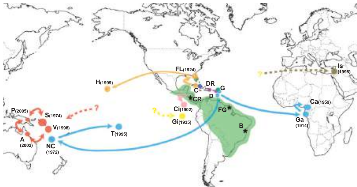
Figure 1 Routes of introduction of Wasmannia auropunctata . Note: Colored dots represent genetically distinct introduced clonal populations. The dark green area represents the native range of W. auropunctata (Wetterer and Porter 2003), and black stars represent areas where populations from the native range have been sampled. The code letter for each introduced country is given in Table 1. Estimated dates of introduction are indicated between brackets when available (see Table S1 for detailed references).