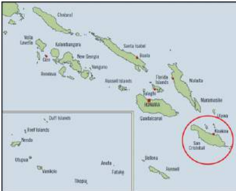
Fig. 1 Map of Solomon Islands showing Makira (San Cristobal) in red circle. (Adapted from: Bourke et al. 2006).