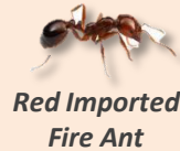
Red Imported Fire Ant