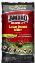
Amdro® Quick Kill Home Perimeter Insect Killer

It is easy to confuse granular barriers with granular baits. Many granular barriers contain synthetic pyrethroids. The active ingredient list will usually contain one or more chemicals with names ending in “-thrin”, like “bifenthrin”, or “cyfluthrin.” Granular barriers also need