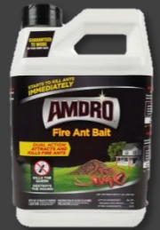
Amdro® Fire Ant Bait

The Hawai‘i Ant Lab recommends that you buy Amdro® Fire Ant Bait for the control of LFA. It contains only one active ingredient, hydramethylnon, a slow acting stomach poison and comes in a white plastic jug. Make sure to broadcast it evenly throughout your property.