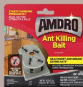
Amdro® Ant Killing Bait