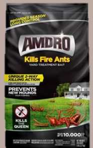
Amdro® Kills Fire Ants Yard Treatment Bait

Amdro® Kills Fire Ants Yard Treatment Bait contains two active ingredients, the insect growth regulator methoprene and hydramethylnon, and comes in a black shaker bag. This product is NOT recommended for the control of LFA. Half of the granules have hydramethylnon and the other half contain methoprene. The formulation of the methoprene granules is not attractive to LFA. Amdro® bait products like Amdro® Ant Killing Bait that DO NOT contain hydramethylnon are also NOT recommended.