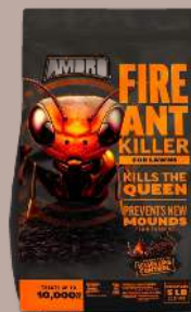
Amdro® Fire Ant Killer For Lawns

contains granules with the active ingredient methoprene (an insect growth regulator) and the other half contain granules with the active ingredient hydramethylnon. LFA are not attracted to the formulation of the methoprene granules.