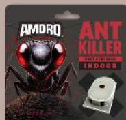
Amdro® Ant Killer Bait Stations

We also do NOT recommend Amdro® bait products like Amdro® Ant Killer Bait Stations that do not contain hydramethylnon.