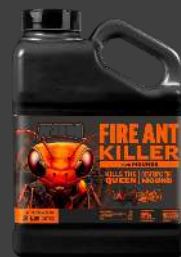
Amdro® Fire Ant Killer for Mounds

active ingredient, hydramethylnon, a slow acting stomach poison and comes in a black plastic jug. Make sure to broadcast it evenly throughout your property.