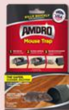
Amdro® Mouse Trap

If Amdro® is your bait of choice, understand that it is a line of products that kill anything from ants to carpenter bees and even mice depending on which product you select.