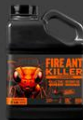
Amdro® Fire Ant Killer for Mounds

We recommend that you buy Amdro® Fire Ant Killer for Mounds for the control of Little Fire Ants. It contains only one active ingredient, hydramethylnon, a slow acting stomach poison and comes in a white plastic jug. Make sure to broadcast it evenly throughout your property.