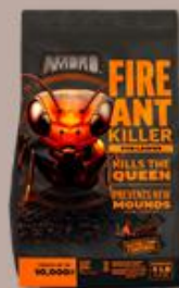
Amdro® Fire Ant Killer For Lawns

We do NOT recommend Amdro® Fire Ant Killer for Lawns which comes in a black shaker bag. Half of this product contains granules with the active ingredient methoprene (an insect growth regulator) and the other half contain granules with the active ingredient hydramethylnon. LFA are not attracted to the formulation of the methoprene granules.