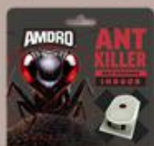
Amdro® Ant Killer Bait Stations

We also do NOT recommend Amdro® bait products like Amdro® Ant Killer Bait Stations that do not contain hydramethylnon.