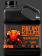
Amdro® Fire Ant Killer for Mounds

We recommend that you buy Amdro® Fire Ant Killer for Mounds for the control of Little Fire Ants. It contains only one active ingredient, hydramethylnon, a slow acting stomach poison and comes in a white plastic jug. Make sure to broadcast it evenly throughout your property.