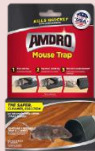
Amdro® Mouse Trap

If Amdro® is your bait of choice, understand that it is a line of products that kill anything from ants to carpenter bees and even mice depending on which product you select.