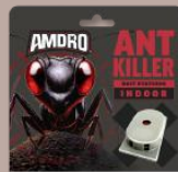
Amdro® Ant Killer Bait Stations

We also do NOT recommend Amdro® bait products like Amdro® Ant Killer Bait Stations that do not contain hydramethylnon.