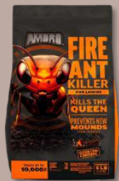
Amdro® Fire Ant Killer For Lawns

We do NOT recommend Amdro® Fire Ant Killer for Lawns which comes in a black shaker bag. Half of this product contains granules with the active ingredient methoprene (an insect growth regulator) and the other half contain granules with the active ingredient hydramethylnon. LFA are not attracted to the formulation of the methoprene granules.