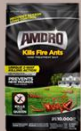
Amdro® Kills Fire Ants Yard Treatment Bait

Amdro® Kills Fire Ants Yard Treatment Bait contains two active ingredients, the insect growth regulator methoprene and hydramethylnon, and comes in a black shaker bag. This product is NOT recommended for the control of LFA. Half of the granules have hydramethylnon and the other half contain methoprene. The formulation of the methoprene granules is not attractive to LFA. Amdro® bait products like Amdro® Ant Killing Bait that DO NOT contain hydramethylnon are also NOT recommended.