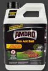
Amdro® Fire Ant Bait

The Hawai’i Ant Lab recommends that you buy Amdro® Fire Ant Bait for the control of LFA. It contains only one active ingredient, hydramethylnon, a slow acting stomach poison and comes in a white plastic jug. Make sure to broadcast it evenly throughout your property.