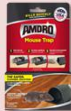
Amdro® Mouse Trap

If Amdro® is your bait of choice, understand that it is a line of products that kill anything from ants to carpenter bees and even mice depending on which product you select.