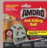
Amdro® Ant Killing Bait