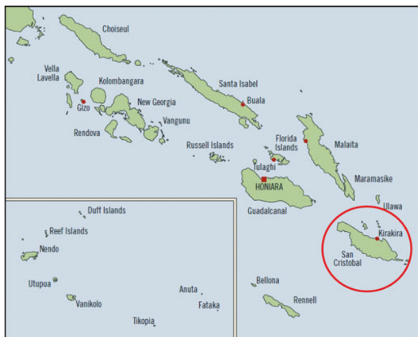
Fig. 1 Map of Solomon Islands showing Makira (San Cristobal) in red circle. (Adapted from: Bourke et al. 2006).