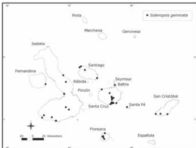
Figure 1. Distribution of Solenopsis geminata in Galapagos.

Islands with a high number of records are probably the result of greater collecting effort rather than reflecting the current abundance and distribution of the fire ants. Indeed, because ant surveys are incomplete, recent reports may not represent the date of arrival of ants at a location and they may have been resident for many years before that. For example, given that S. geminata was first reported from San Cristóbal in 1891 (Brandão & Paiva 1994) and that this species uses nuptial flights to establish new colonies, the lack of records from some islands suggests a need for further sampling rather than a lack of dispersal. On the other hand, some reports have been confirmed as truly recent introductions, such as the new report of S. geminata at Punta Mangle, Fernandina, a location that was monitored for fire ants in 1998 (L. Roque-Albelo & C. Causton unpubl.).